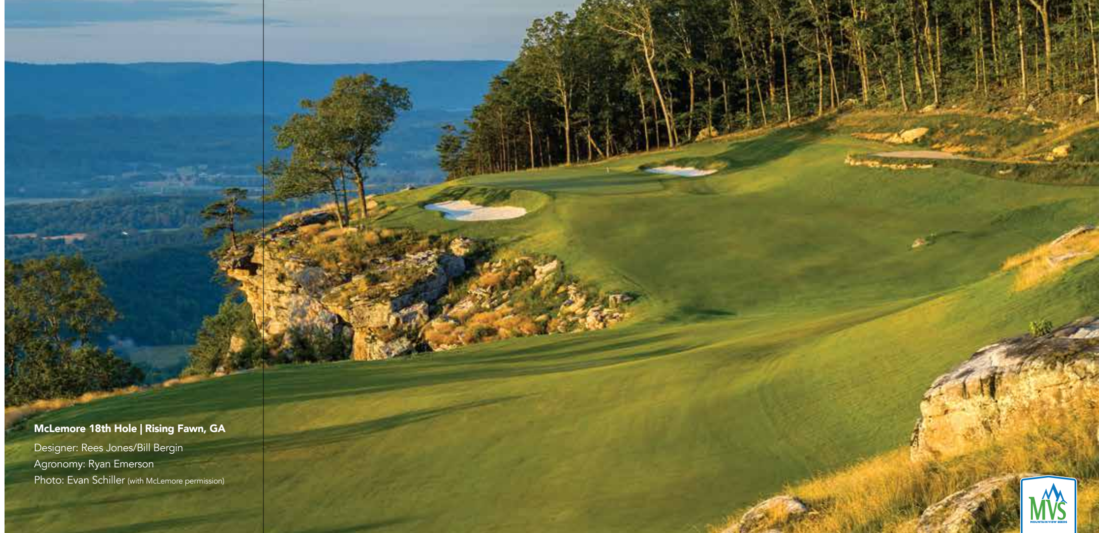
McLemore 18th Hole | Rising Fawn, GA

History has a way of repeating itself, follow our field of proven NTEP Champions: Shark, Barracuda, Piranha, PIPER & OAKLEY