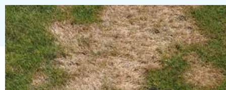
Seedling Damping Off ( Pythium spp.)