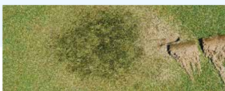
Pythium Root Rot